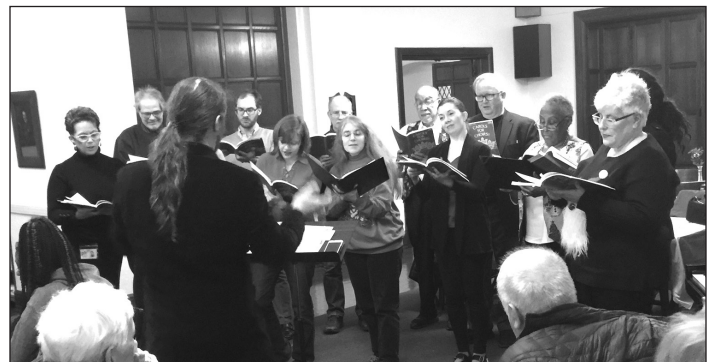
Above: The choir provides our dinner music

The second annual Coneys, Carols, Cookies and Carillon evening December 19 welcomed some 65 people to JAPC. Diners enjoyed "real" coneys - complete with chopped onions and lots of mustard, charming party sandwiches, chips and dip and cookies. The JAPC choir provided wonderful music in Dodge Hall, after which people were invited to take a cup of hot chocolate and venture outside to hear Christmas music on the carillon. Folks returned to the warmth of the sanctuary for the popular singalong, accompanied by Steve Warner on the organ.