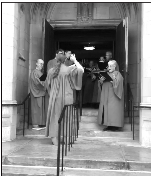
The Chancel Choir sings through the newly re-opened front doors on Palm Sunday.